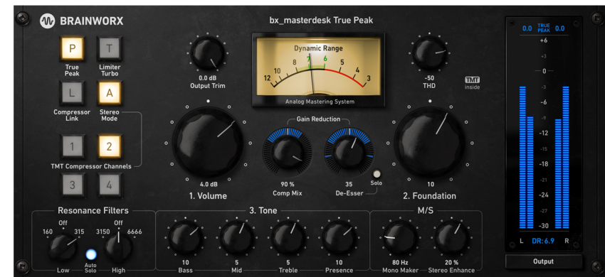
bx_masterdesk True Peak